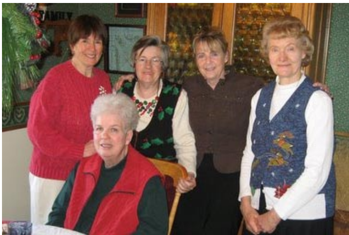
Bald Eagle Chapter members at Christmas Party 2008