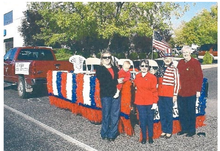
Color Country Chapter members take place in Veterans Day Parade.