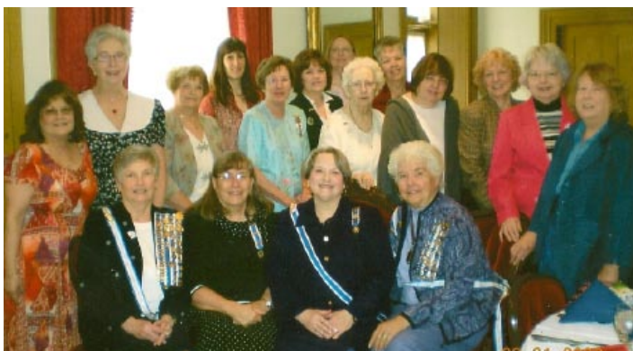
Salt Lake Valley Chapter celebrates their 50th Birthday at the Lion House.