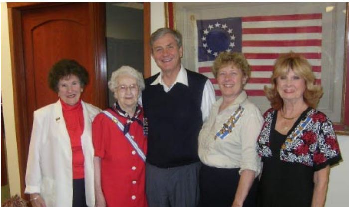
Constitution Week Proclamation signing