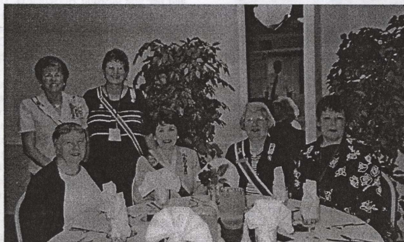
Dinner Monday Night at the Plaza Hotel