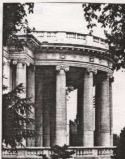
Memorial Continental Hall