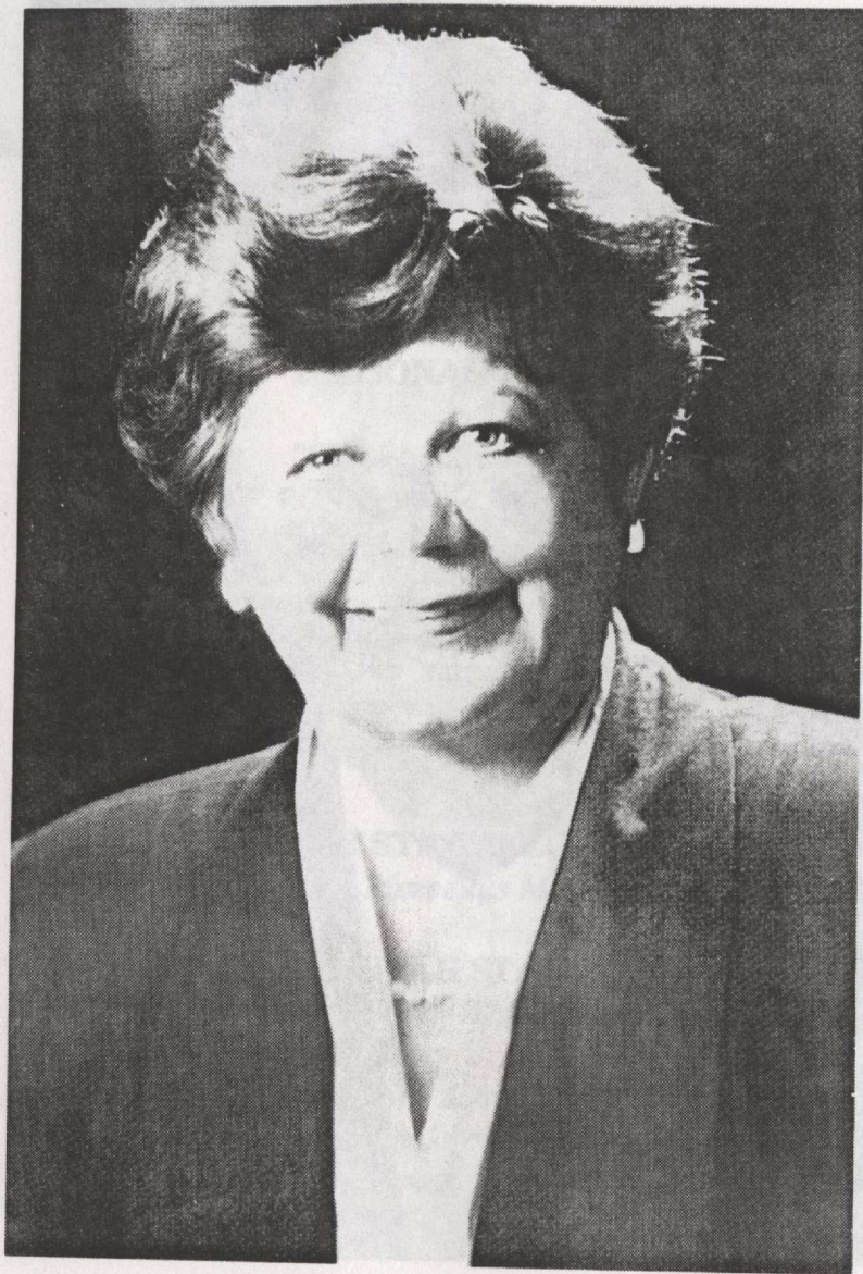
Olene Walker Lt. Governor State of Utah