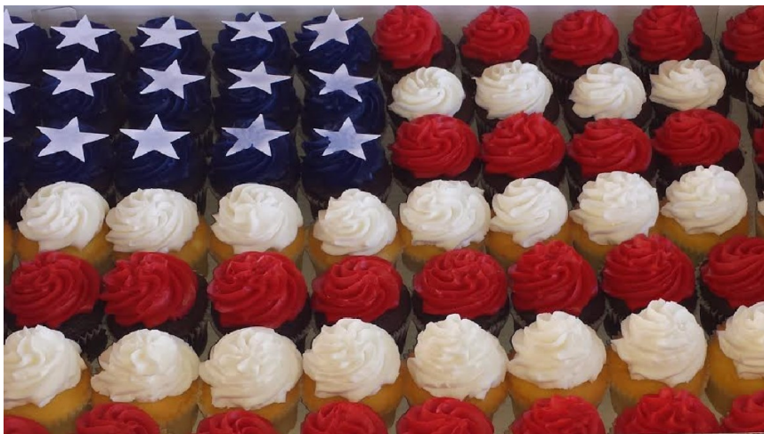
Golden Spike's Flag Day dessert.

It was a thrill when DAR awarded an $8,450 chapter-sponsored Special Projects Grant to the Weber County Heritage Foundation to help fund its