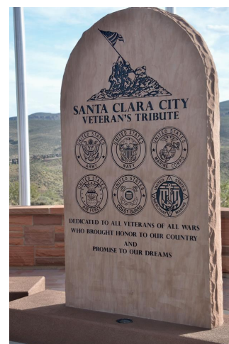
Santa Clara Veterans Monument